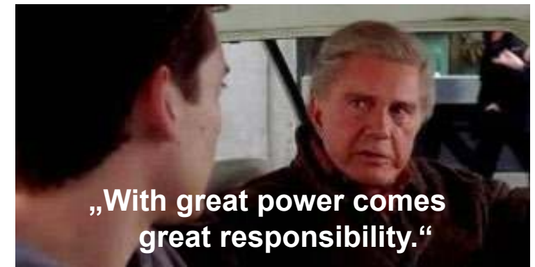
Uncle Ben to Peter Parker in Spiderman